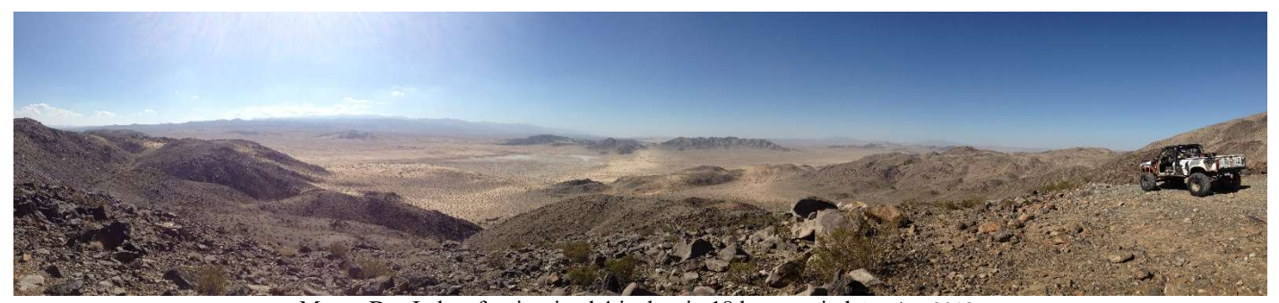
Means Dry Lake after it rained 4 inches in 18 hour period October 2018.

July, Aug, Sept, Oct, Nov, Dec 2023 An award-winning publication. A monthly publication of the Dirt Devils a 501(c)(7) corporation 960 N Tustin St #120 Orange CA 92867 http://www.dirtdevils.org/